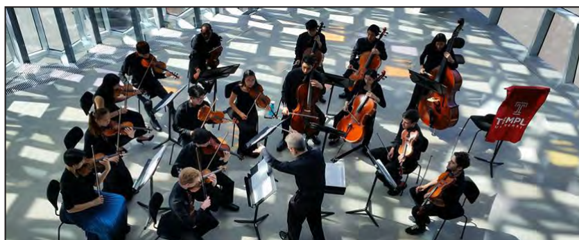
Temple Music Prep Youth Chamber Orchestra