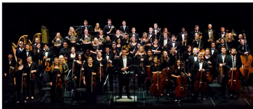
West Chester University Symphony Orchestra

A Musical Journey for Unity and Humanity